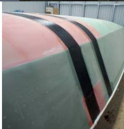
Hull and foredeck being laminated on Elliot 9.2